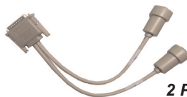
2 Port Y-Cable