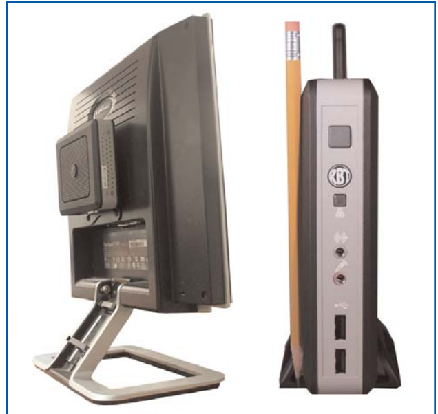
:*Shown with Optional Internal Wireless

The RBT-402 offers the look and feel of Windows Vista and the versatility and speed of Linux.